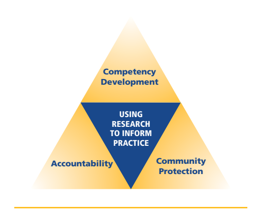
Figure 1: Integration of BARJ and JJSES